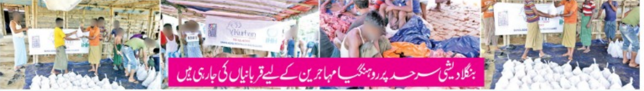
بنگلادیشی سرحد پر روہنگیا مہاجرین کے لیے قربانیاں کی جا رہی ہیں