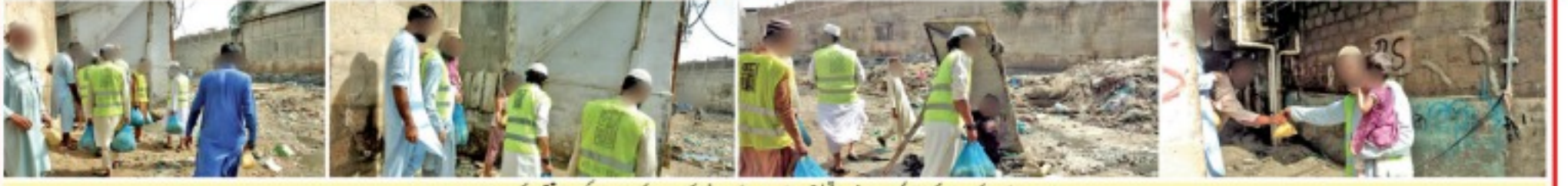
مسائبہ ماہوں کے دوران کراچی کی مناسفانی پھیر میں بیت اسلام فوڈ بانک کے سٹاٹف کا تقسیم کر رہے ہیں