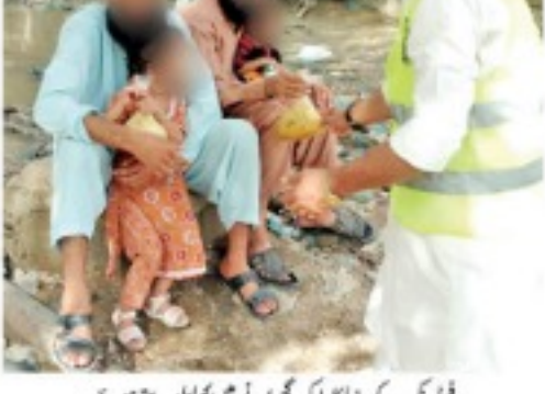
فوز بک کے رضا کار ایک گھرانے میں کھانا دے رہے ہیں

بیت السلام آؤٹ ریک کے رضا کاروں نے برقی بائش اور پانی کے محرم علاقوں کے کیمپوں میں پکا پکایا کھانا تقسیم کیا