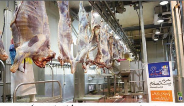
بیت السلام کے زیر نگرانہ اجتماعی قربانی کے ذبح خانے کا ایک منظر (انداز کے صفحے پر مزید تصاویر ملاحظہ کیجیے)

سندھ، پنجاب، بلوچستان کے پی کے گلگت بلتستان اور آزاد کشمیر کے 77 اضلاع میں قائم 264 مراکز میں ہزاروں قربانیوں کی گیس، پيس ماندہ مہینوں اور مضافاتی علاقوں کے لاکھوں افراد تک گوشت پہنچایا گیا