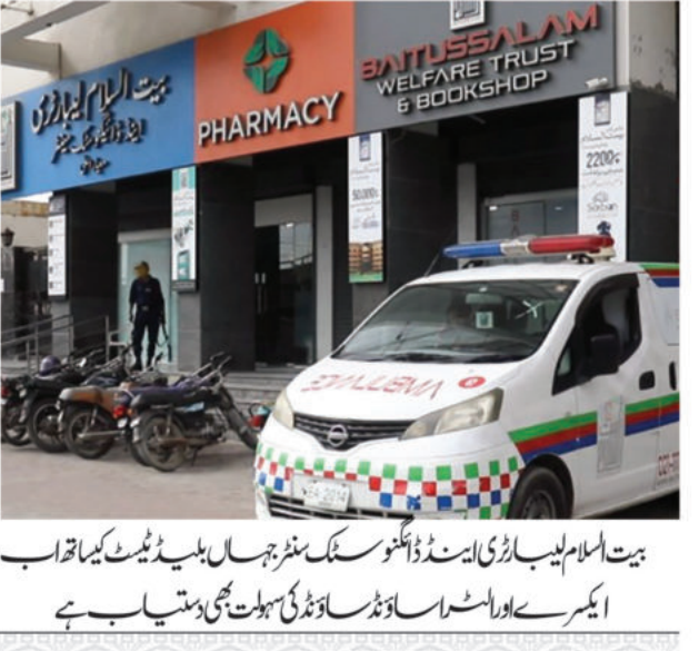
بیت السلام لیب آڈیٹڈ اینڈ کنٹریولڈ سٹور ہسپتال بلیڈ ٹیسٹ کیساتھ ایکسرے اور الرٹناؤڈ سٹریٹجی دستیاب ہے

کراچی (پ ر) بیت السلام ویلفیئر ٹرسٹ نے سوا سال پہلے کراچی کے محکمہ صحت کے ماتحت ریسپانسیب ڈسپنسنری میں سستی روٹی پروگرام کی نگرانی اور نگرانی کے لیے تقریباً 100 ٹن سے زیادہ روٹی کی تقسیم کیا ہے۔ باقی صفحہ نمبر 2