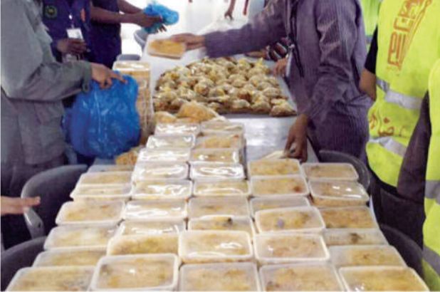
بیت السلام ویلفیئر ٹرسٹ کے رضاکاروں نے کھانا پیک کرتے ہوئے

بیت السلام ویلفیئر ٹرسٹ نے کراچی (پ ر) ترک رفاہی ادارے کے تعاون سے بیت السلام ویلفیئر ٹرسٹ نے بیت السلام ویلفیئر ٹرسٹ نے کراچی (پ ر) ترک رفاہی ادارے کے تعاون سے بیت السلام ویلفیئر ٹرسٹ نے بیت السلام ویلفیئر ٹرسٹ نے کراچی (پ ر) ترک رفاہی ادارے کے تعاون سے بیت السلام ویلفیئر ٹرسٹ نے بیت السلام ویلفیئر ٹرسٹ نے کراچی (پ ر) ترک رفاہی ادارے کے تعاون سے بیت السلام ویلفیئر ٹرسٹ نے